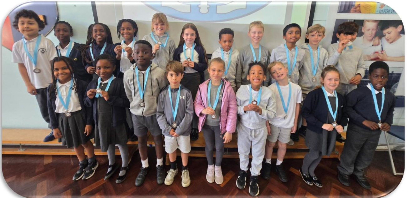
Years 3&4 Sportshall Athletics Team