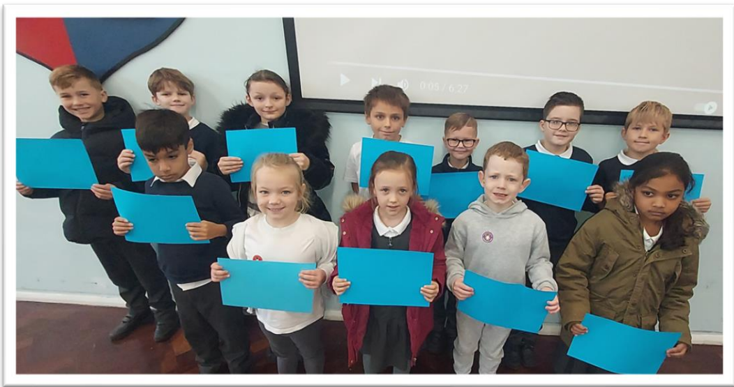
Week 7: Taking Risks