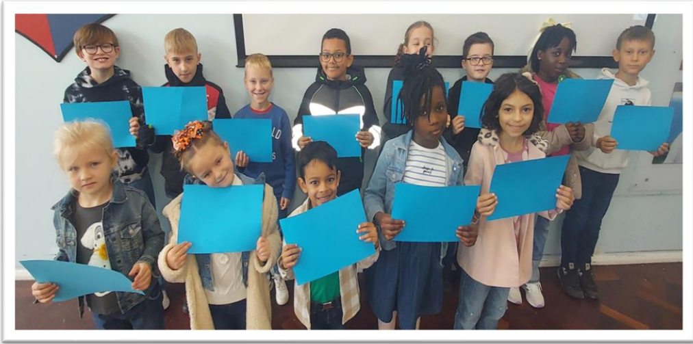
Week 6: Asking Questions