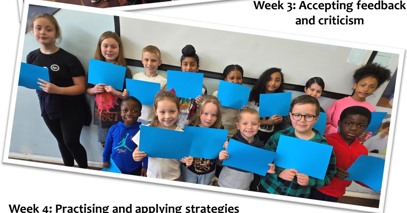
Week 4: Practising and applying strategies