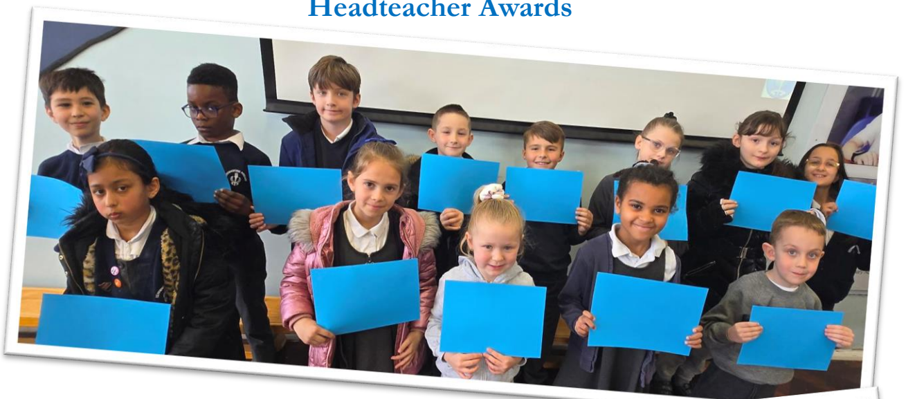
Week 2: Learning from mistakes