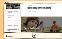
Work through the courses at your own pace