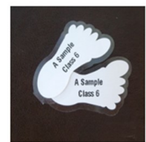
Peel & Stick Shoe Labels

5 Name Labels £ 1.00 10 Name Labels £ 1.75 15 Name Labels £ 2.50