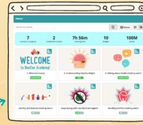
Online courses covering a range of healthy topics

FREE online course for parents to learn how to improve their family's health and wellbeing.