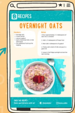
Get free recipes and other healthy living resources

SIGN UP FOR FREE AT beezebodies.com/academy