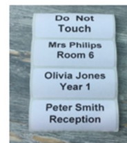
Peel & Stick Labels

10 Labels £ 2.00 20 Labels £ 3.50 30 Labels £ 5.00