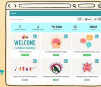
Online courses covering a range of healthy topics

FREE online course for parents to learn how to improve their family's health and wellbeing.