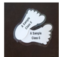
Peel & Stick Shoe Labels

5 Name Labels £ 1.00 10 Name Labels £ 1.75 15 Name Labels £ 2.50