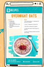
Get free recipes and other healthy living resources

SIGN UP FOR FREE AT beezebodies.com/academy