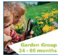
Garden Group 24 - 60 months