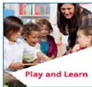
Play and Learn