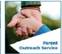
Parent Outreach Service