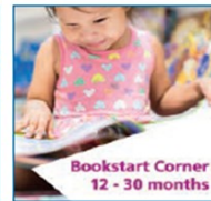
Bookstart Corner 12 - 30 months