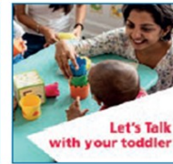
Let's Talk with your toddler