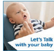
Let's Talk with your baby