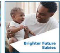
Brighter Future Babies

For information visit: askthurrock.org.uk