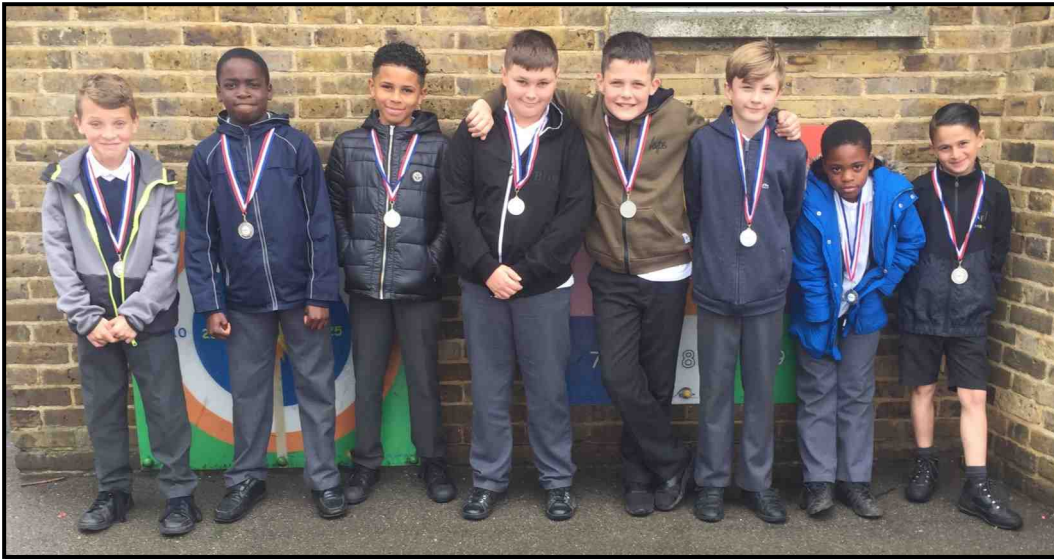
Well done to our Boys' Football Team, Thurrock Football Western League Runners Up Medal winners!