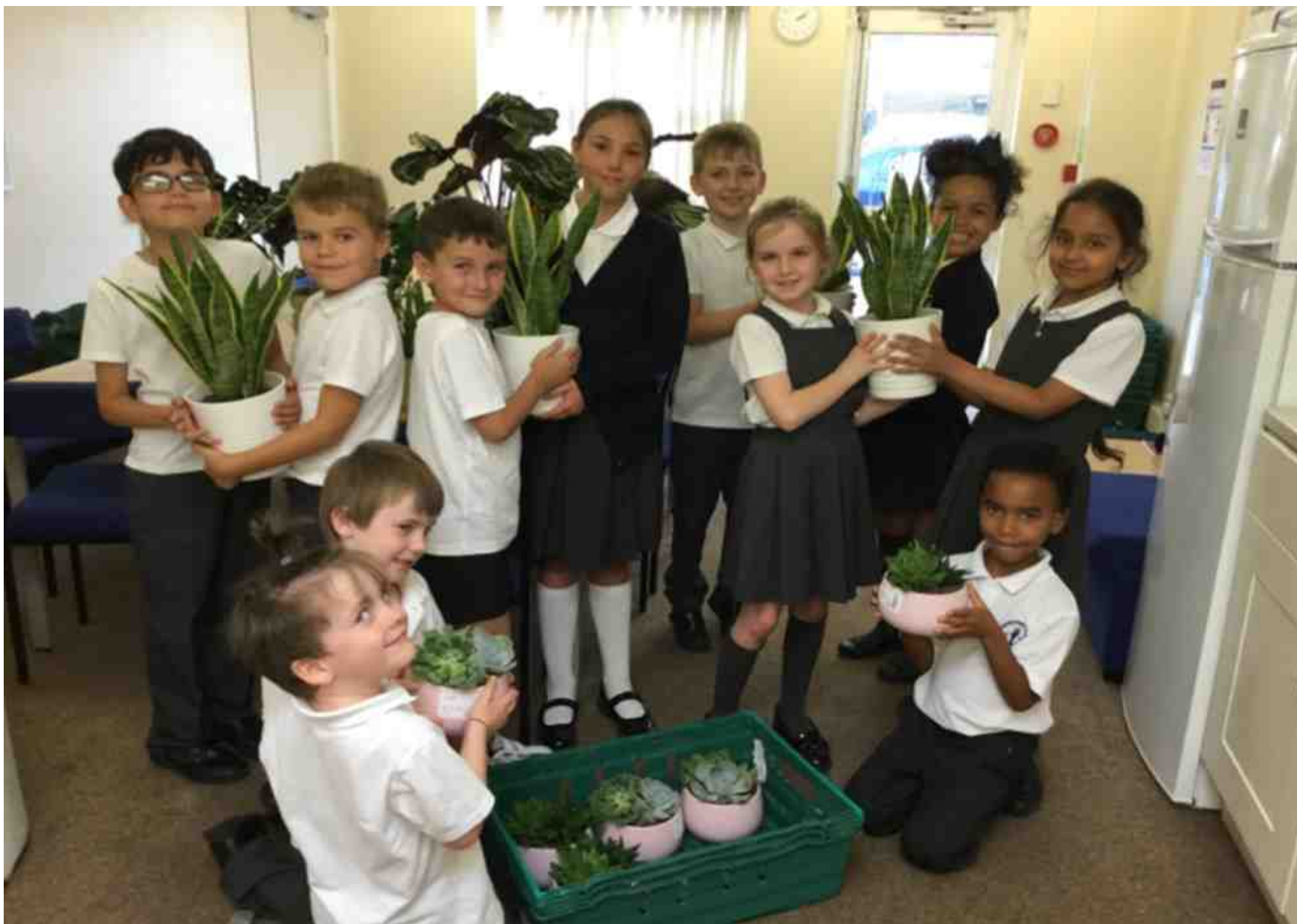
This year's eco-warriors with the new indoor plants